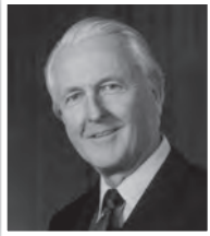
W. Galen Weston

Chairman & President, George Weston Limited