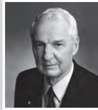
Hon. Paul Desmarais

Chairman & President, George Weston Limited